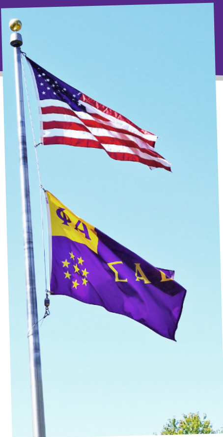
The flagpole outside of the Sigma Alpha Epsilon Fraternity house has regained the flags of our fraternity, symbolizing our return to 140 Lynn Avenue