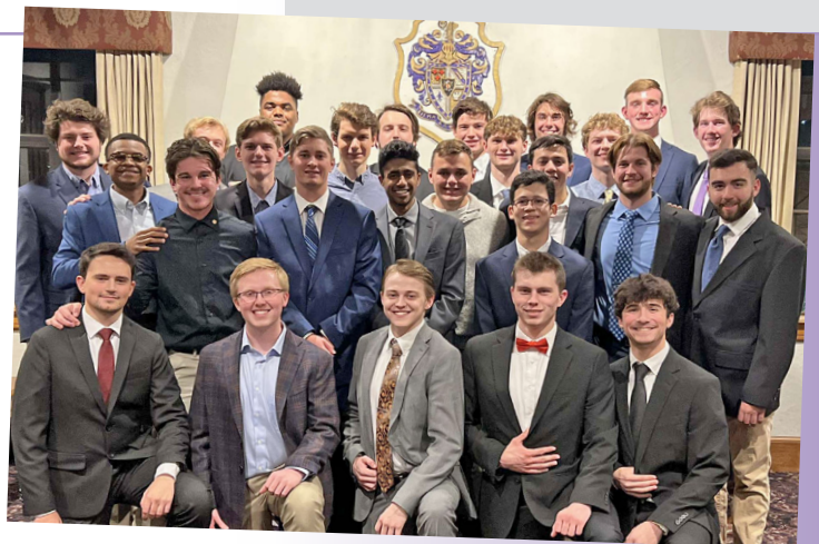
The Men of Iowa Gamma